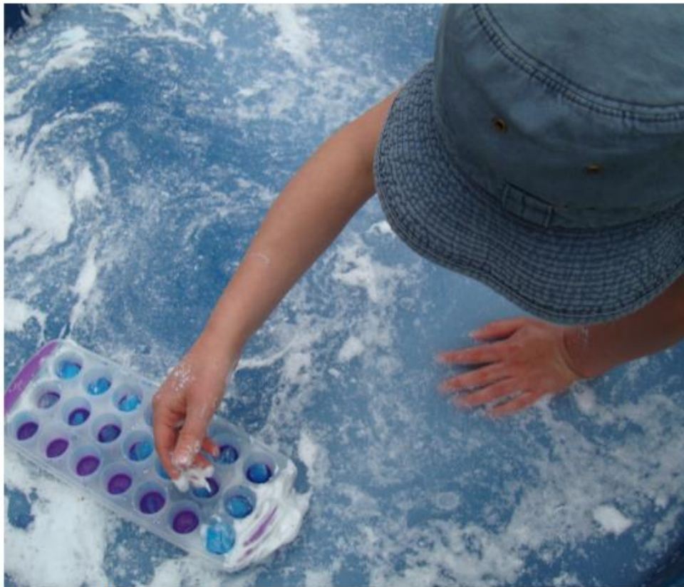
Marble Hill Playcentres (£9,400)

RPLC was founded by George III in 1786 to support the poor of Richmond. This work continues today. At a time of increasing requests for support from charities struggling to cope with increasing demand on their services, Trustees strive to ensure that RPLC's own limited resources are used as effectively as possible. While on a day to day basis current needs are met, Trustees also recognise the need to ensure that there will also be resources to support future generations.