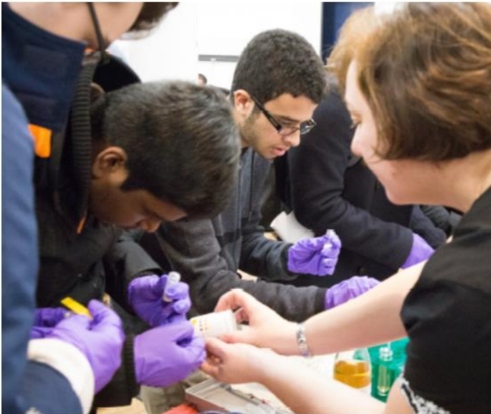
Education Business Partnership (£15,000)