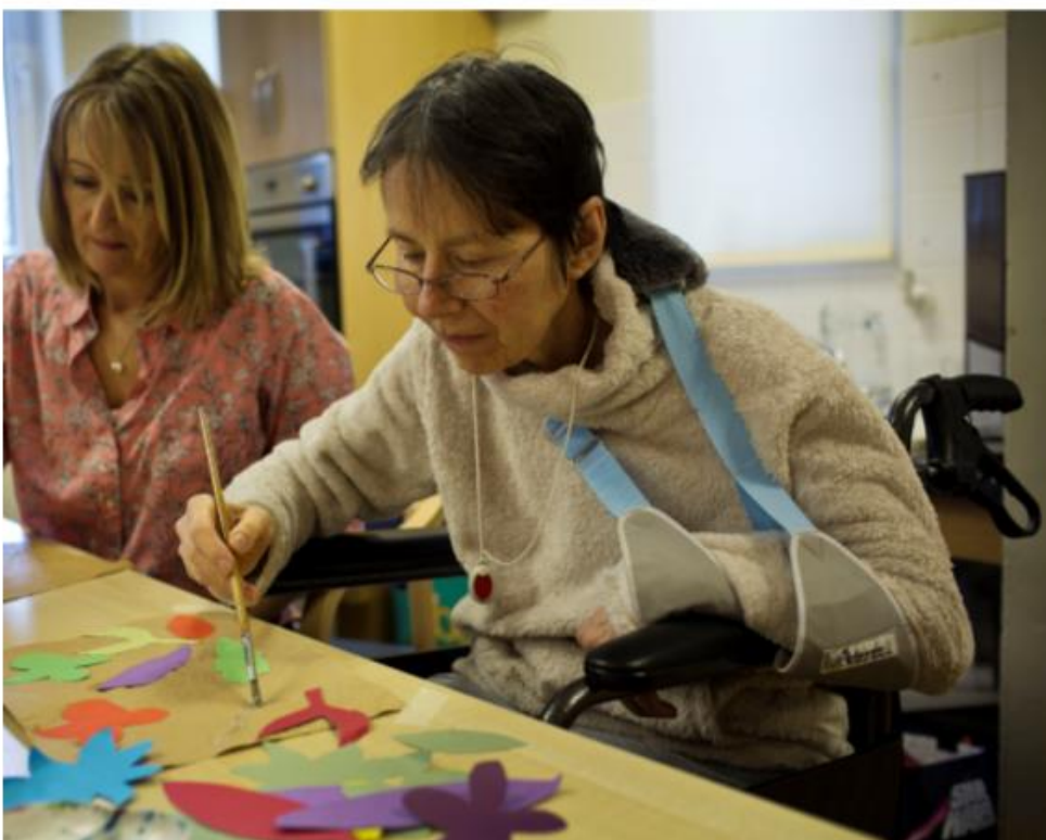
Integrated Neurological Services (£51,715)

RPLC is most effective when working in partnership with local charities and other stakeholders. By working together our efforts are amplified, and there is a greater chance of making a difference.