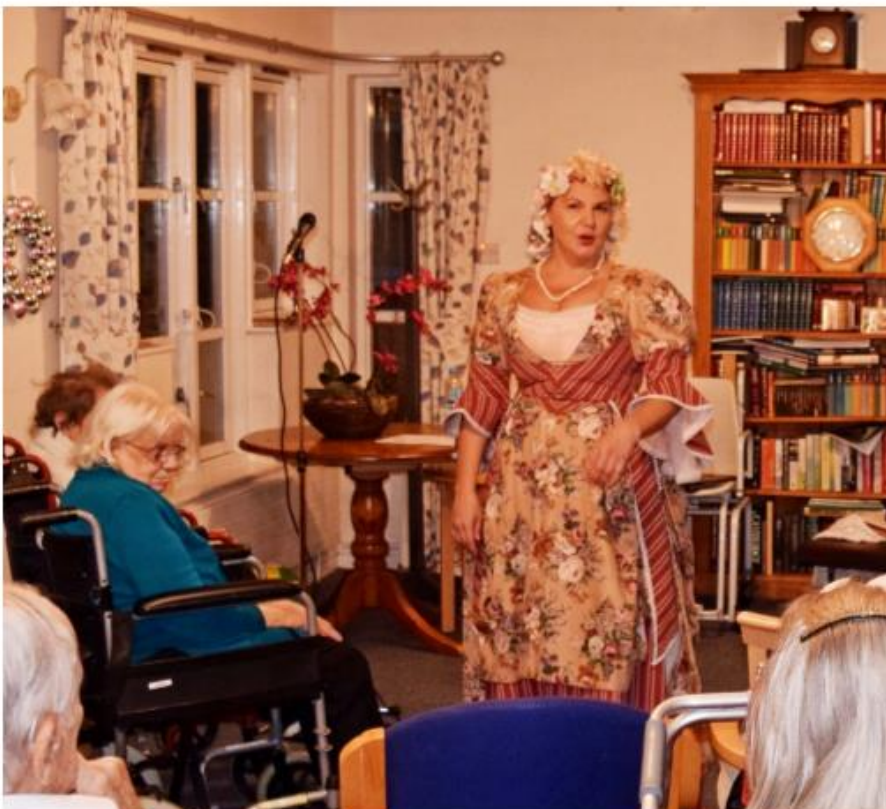
Bold Balladiers (£1,000)

Trustees have for some time been aware that the sports area on the Queen's Road Estate has become under-used and that the surrounding area could benefit from some redevelopment. With the assistance of Rolfe-Judd Architects a vision for the site was put to public consultation and a planning application is being prepared for submission to Council Officers in the Summer. Proposals include the building of a new block comprising 11 one-bed and 1 two bed units, a new car parking area and an updated recreation space outside the Cambrian Centre and Dickson House.