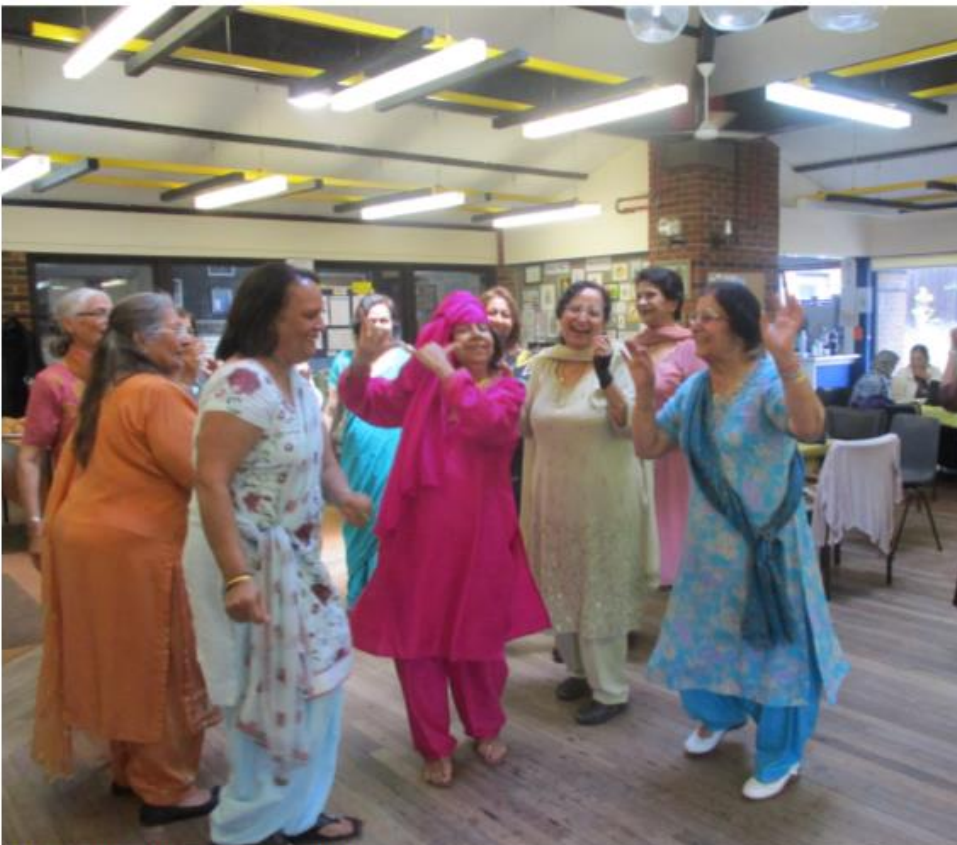
Multicultural Richmond (£7,400)