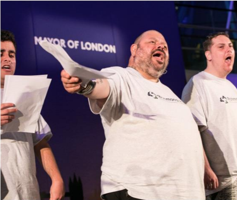
Richmond Users Independent Living Scheme £12,500