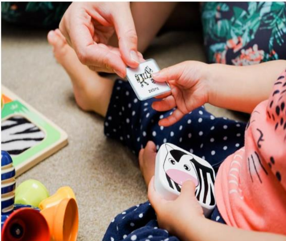
Skylarks Charity (£12,241)

Rent subsidies to 73 households amounted to £560k. Total funding for charitable activities therefore amounted to £2.15m.