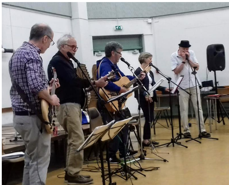
South West London Stroke Association

Similarly, with our corporate supporters who are less likely to be in a position to provide financial support for our work if they are struggling themselves.”