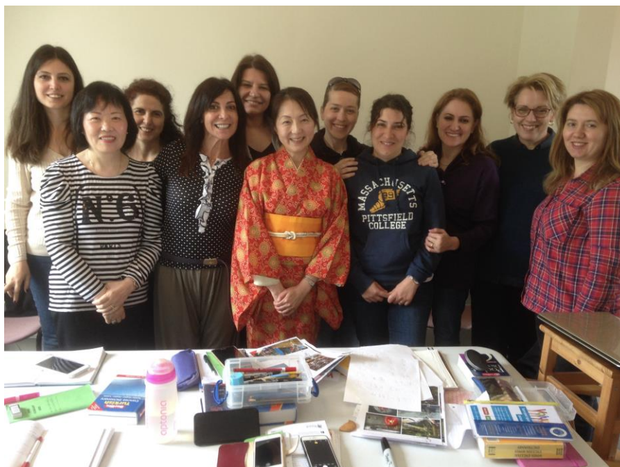
Richmond English as an Additional Language (EAL) friendship group

Even a small grant, such as that made to Healthwatch (£1,500) can provide some valuable information. A survey was carried out on the needs and experiences of the local community in lockdown. The survey showed that people wanted to feel safer when accessing care and support – the lack of clarity over PPE arrangements on the way to and in clinical settings was unsettling. Those who are less confident about using the internet have reported difficulties with accessing care online (i.e. repeat prescriptions and there is a growing digital divide. Loneliness and isolation represented the most significant issues cited by the wellbeing survey respondents.