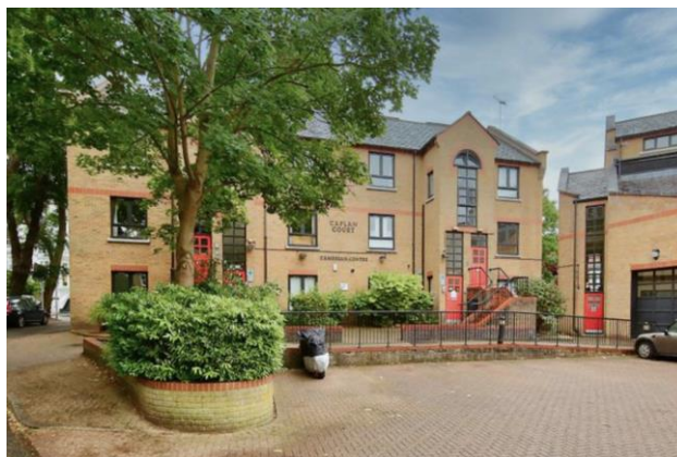
The Cambrian Centre and Caplan Court

Two thirds of RPLC's assets are held in residential and commercial properties. The management and maintenance of properties, and the care for tenants and leaseholders are major commitments for RPLC. During the year a new management agreement was agreed with HML Group who have worked for RPLC for many years. A property in Sheen was sold during the year. All the residential investment properties remained fully occupied. Major maintenance works were required on two units, one on the Cambrian Road and another in Caplan Court. These are expected to be completed by the Autumn.