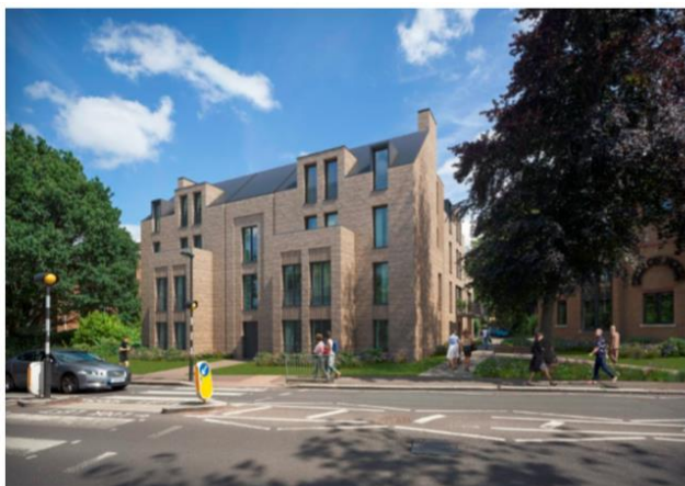
Planned affordable housing alongside the Queen's Road, Richmond

After a prolonged planning process RPLC's application for a new residential build with 12 one and two-bed affordable units alongside the Queen's Road received unanimous approval from the local Planning Committee. The proposal also allows for a reordering of the nearby parking and the creation of a more flexible community-oriented recreation space. RPLC does not intend to directly undertake the development but is seeking interested parties to purchase a long lease and undertake the build.