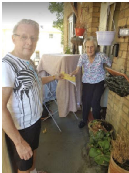
Kew Neighbourhood Association

First time funding covered a range of activities. Beautifully Made Foundation provides work and other opportunities for adults with lifelong learning disabilities. Dose of Nature is a new charity promoting the mental health benefits of spending time in nature through social prescribing, training programmes, a youth ambassador scheme, and workshops. Grass Roots Forest School funding was to launch a programme whereby eight students from a pupil referral unit and 12 vulnerable schoolchildren from St Richard's Primary School engage in their community and education through nature and environmental projects.