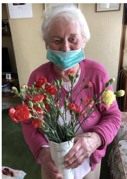
'Flower Lady' Crossroads Care, Richmond