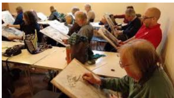
Mortlake Community Association

RPLC has always tried to keep in touch with emerging needs and to provide help to individual and organisations requesting support. While RPLC has well established funding streams and grant making processes with which applicants are familiar, the Charity also tries to be flexible and agile in the face of critical need. The C-19 crisis showed that RPLC, along with others in the sector, needed to adapt to working at home. We learned that different ways of reviewing applications were needed and that budgets had to be adapted if RPLC was going to help the sector survive the initial challenges posed by lockdown. An additional £300k was made available, the funding limits for Crisis Grants were increased, and where possible agreement was given for funds that were already paid could be reassigned to C-19 related activities.