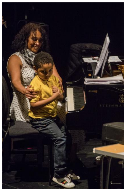
Otakar Kraus Music Trust

d) job clubs, addressing digital poverty, and the training and retention of staff in the local voluntary sector and key workers.