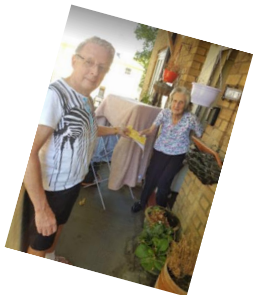
Figure 2: Kew Neighbourhood Association (£12,200)