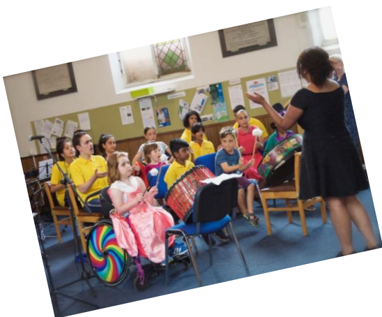
Figure 1: Otaker Kraus Music Trust (£15,830)