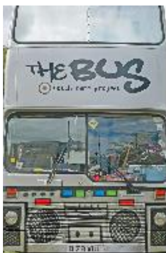
RYP - Youth Community Bus