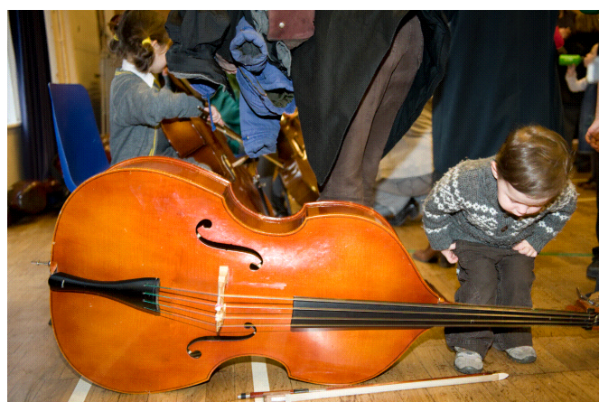
4 Hands On—Richmond Music Trust

Cover Photographs (from the left) Home Start - What makes me happy Planting the reed bed in Barnes 1 O'clock Club Youth Café Bus Ham Under 15s Football Club Large Picture: 1 O'clock Club