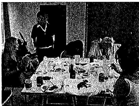
Young Parents Project, Art Session