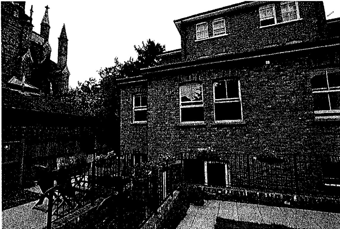
The new SPEAR building – Penny Wade House